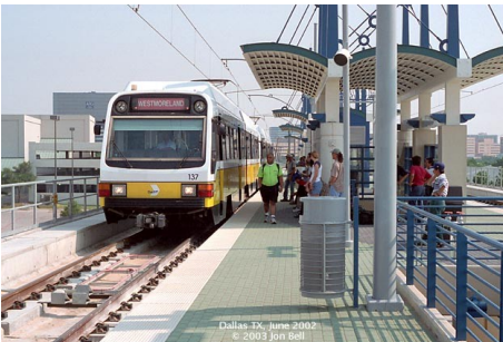
Dallas light rail.

Transit reduces U.S. dependence on foreign oil and greenhouse gas emissions. 68% of all oil consumed in the U.S. is consumed for transportation. 33% of greenhouse gas emissions are produced by transportation. Vehicle miles traveled has grown substantially faster than the population. Improving vehicle efficiency alone cannot achieve a reduction in oil consumption or greenhouse gas emissions. 4