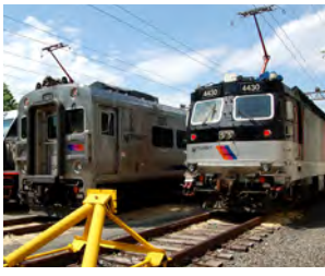
New Jersey Transit